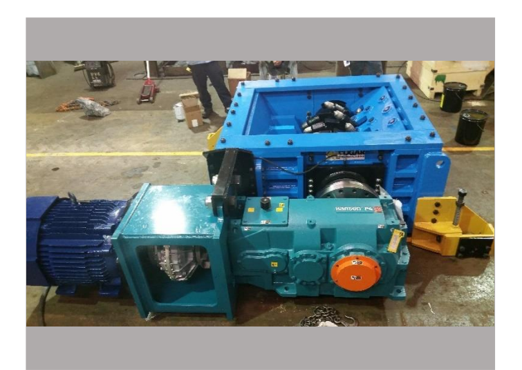
Cogar Heavy Duty Crusher