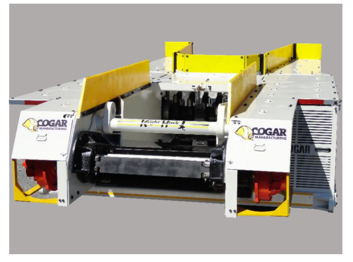
Cogar is the Market Leader in Feeder-Breakers