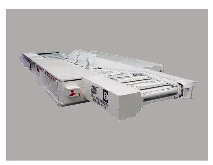
Cogar Low Seam Feeder