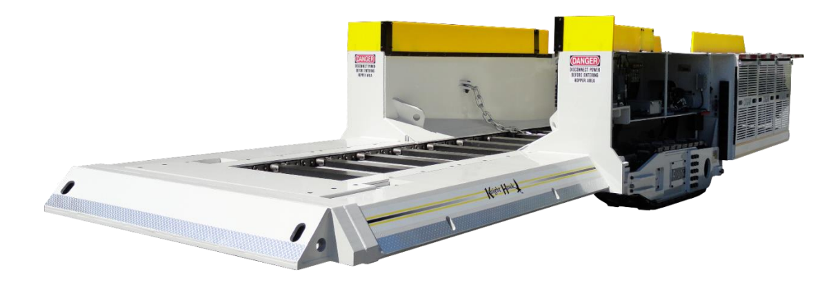
Cogar Underground Feeder-Breaker

Cogar Manufacturing was established in 1979 and has grown throughout the years thanks to the dedication of its employees and the help of its customers. The company is based on a simple premise: listen to the people who run and maintain the machines, give them what they ask for, and provide the best customer service in the industry.