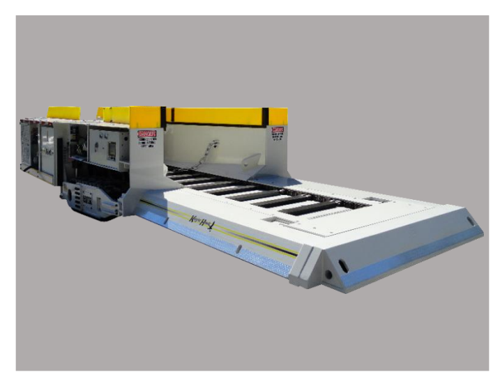
Cogar Feeder-Breaker for Knight Hawk