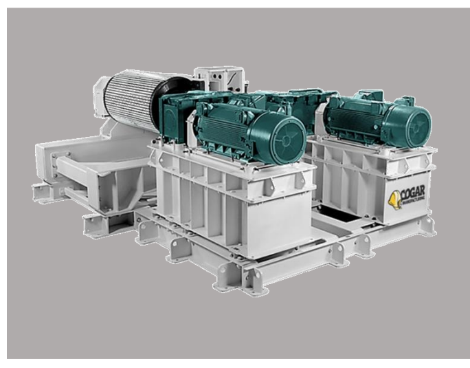
Belt Drives Manufactured by Cogar