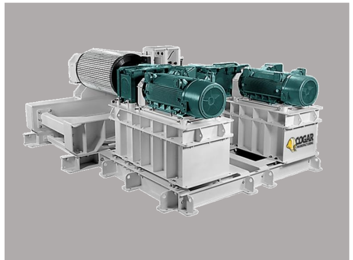
Belt Drives Manufactured by Cogar