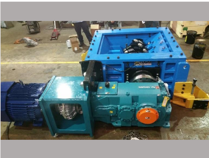
Cogar Heavy Duty Crusher