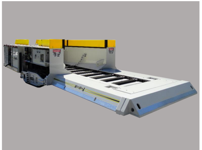
Cogar Feeder-Breaker for Knight Hawk