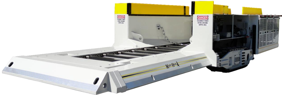
Cogar Underground Feeder-Breaker

Cogar Manufacturing was established in 1979 and has grown throughout the years thanks to the dedication of its employees and the help of its customers. The company is based on a simple premise: listen to the people who run and maintain the machines, give them what they ask for, and provide the best customer service in the industry.