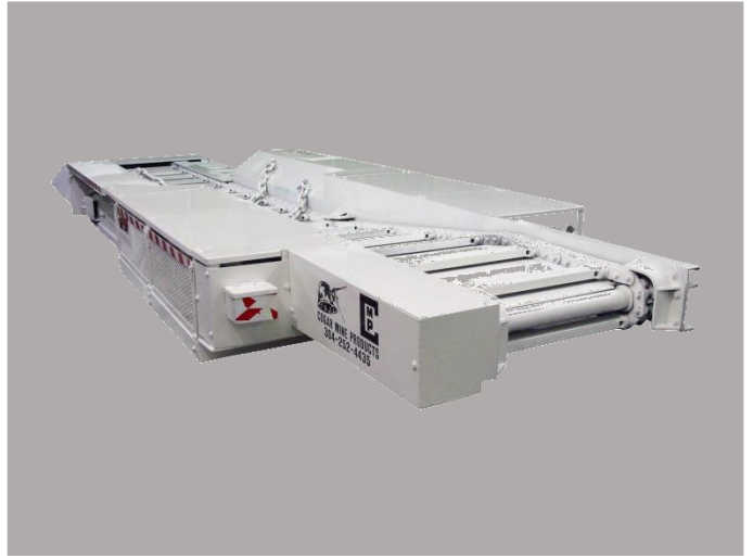
Cogar Low Seam Feeder