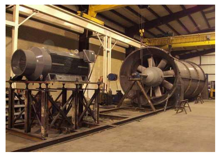
Paul's Fans Assembly Shop