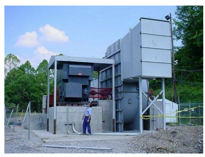
Paul's Fans Centrifugal Fan